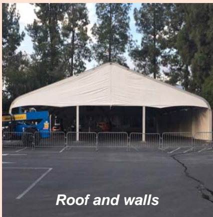
Roof and walls