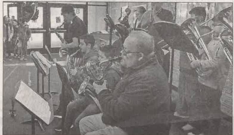
Right: The Indian Trail Jazz Ensemble provided live music at the west entrance of ITJH while members of Project POP hosted a Kindness Tunnel to celebrate Random Acts of Kindness.