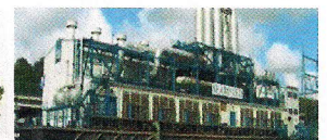
Processing (Meat, fruit, vegetables, trees, etc.)