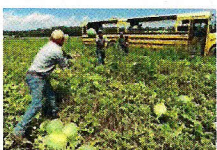
Harvest (fruit and vegetables)