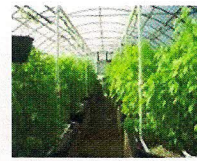
Nursery, Sod, Greenhouse