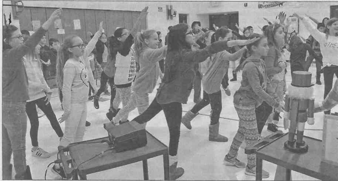
Students at Ardmore School shared what they knew about the story of The Nutcracker , with members of the Salt Creek Ballet Orchestra Outreach program.