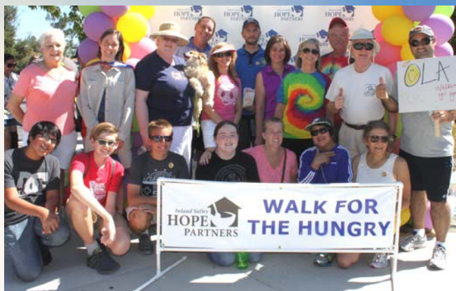
See Page 6

Our Lady of the Assumption Catholic Community