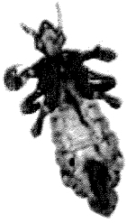
Adult louse.

Adult: The fully grown and developed adult louse is about the size of a sesame seed, has six legs, and is tan to grayish-white in color. Adult head lice may look darker in persons with dark hair than in persons with light hair. To survive, adult head lice must feed on blood. An adult head louse can live about 30 days on a person's head but will die within one or two days if it falls off a person. Adult female head lice are usually larger than males and can lay about six eggs each day.