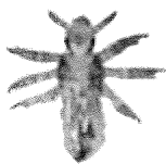
Nymph form.

Egg/Nit: Nits are lice eggs laid by the adult female head louse at the base of the hair shaft nearest the scalp. Nits are firmly attached to the hair shaft and are oval-shaped and very small (about the size of a knot in thread) and hard to see. Nits often appear yellow or white although live nits sometimes appear to be the same color as the hair of the infested person. Nits are often confused with dandruff, scabs, or hair spray droplets. Head lice nits usually take about 8–9 days to hatch. Eggs that are likely to hatch are usually located no more than \frac{1}{4} inch from the base of the hair shaft. Nits located further than \frac{1}{4} inch from the base of hair shaft may very well be already hatched, non-viable nits, or empty nits or casings. This is difficult to distinguish with the naked eye.