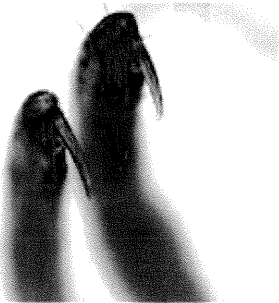
Adult louse claws.

Adult: The fully grown and developed adult louse is about the size of a sesame seed, has six legs, and is tan to grayish-white in color. Adult head lice may look darker in persons with dark hair than in persons with light hair. To survive, adult head lice must feed on blood. An adult head louse can live about 30 days on a person's head but will die within one or two days if it falls off a person. Adult female head lice are usually larger than males and can lay about six eggs each day.