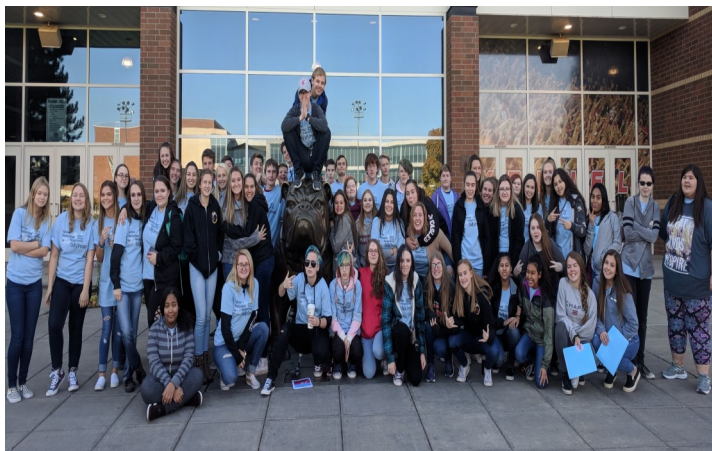
University High School Students at the Gonzaga University Choral Invitational on October 16th where they performed, attended clinics, and sang with over 250 choir students from the Spokane area!