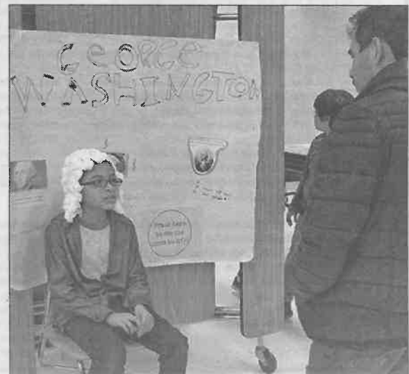
Right: This 5th grade student takes on the role of George Washington, our nation's first President.