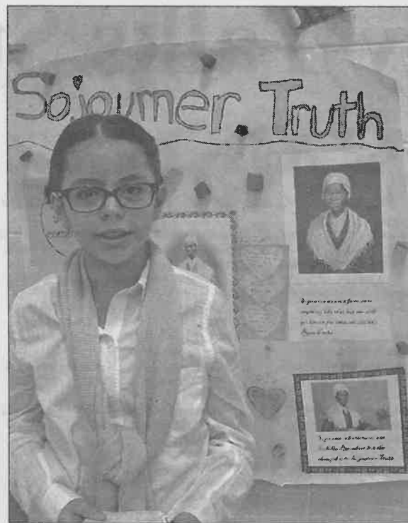
Above: This 5th grade student portrayed the character Sojourner Truth at Lake Park's own interactive wax museum. Born into slavery, Truth was an abolitionist and a women's rights activist, who went to court to recover her son and in 1828, became the first black women to win such a case against a white man.