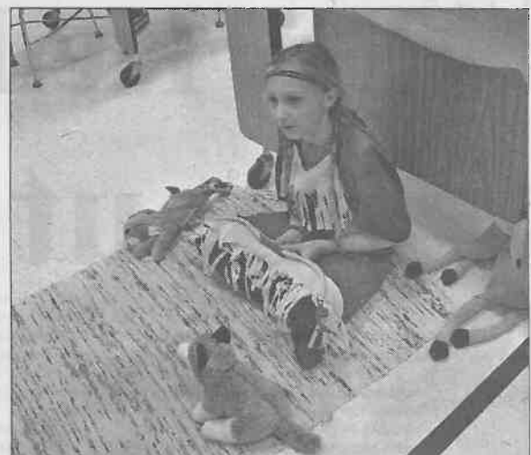
Pictured here is a 5th grader from Lake Park School playing the role of Pocahontas when the class created its own interactive wax museum.