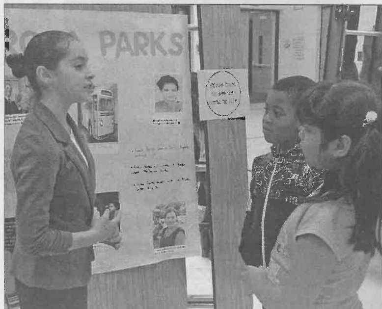
This 5th grader portrays Rosa Parks as she speaks to younger Lake Park students who came to visit the class's "wax museum." Parks told the story of refusing to give up her seat on a bus to a white man.