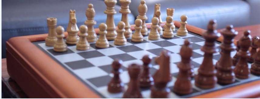
Visit the Puma Lounge