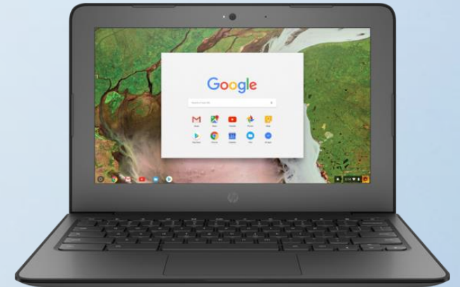
Get Chromebook Help