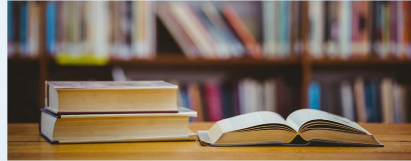
Checkout Library Books