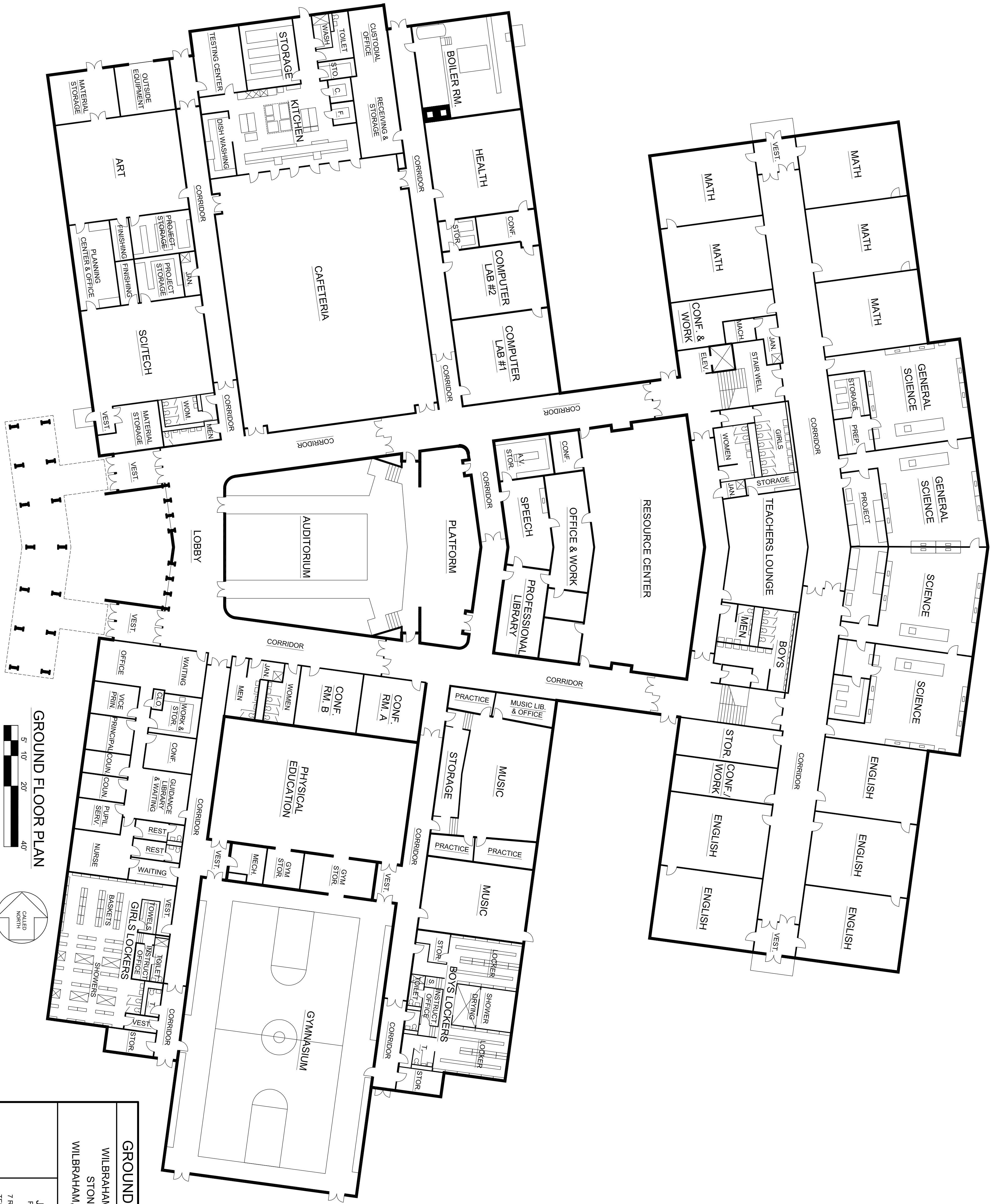
GROUND FLOOR PLAN 5' 10' 20' 40'