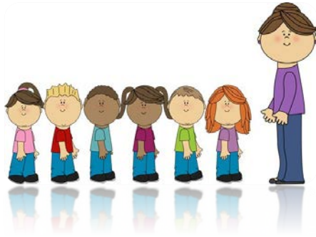
LEAP Students with LEAP Staff

California School for the Deaf 39350 Gallaudet Drive Fremont, CA 94538