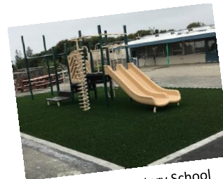
Vannoy Elementary School Playground