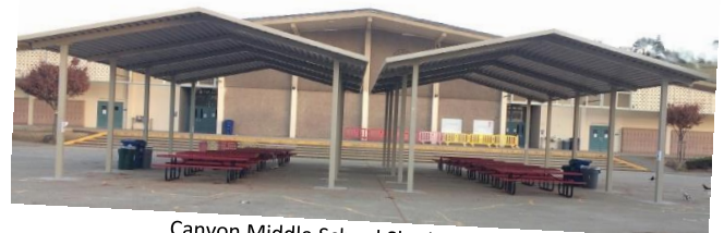
Canyon Middle School Shade Structures