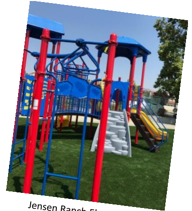
Jensen Ranch Elementary School Playground

community's patience and confidence as the bond projects are systematically structured. The State of California requires Citizens' Bond Oversight Committees (CBOCs) to inform the public concerning the expenditures and use of bond funds at least once a year. This is the First Annual Citizens' Bond Oversight Committee (CBOC) Annual Report as of December 31, 2017.