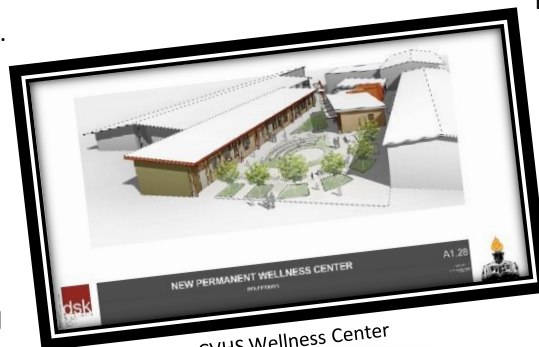
CVHS Wellness Center

The Committee acts in an oversight capacity on all bond related proposals and expenditures and reports to the public and the Board concerning the expenditures of bond revenues per Education Code section 15278 (b). The Committee is actively involved in gathering bond related information and advising the Board of Education on all bond related matters.