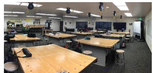
CVHS PLTW Classroom