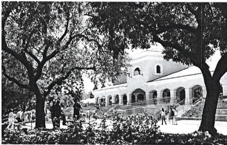
Los Angeles Pierce College - Admissions and Records Office 6201 Winnetka Avenue, Woodland Hills, CA 91371-0001 http://piercecollege.edu/admissions/