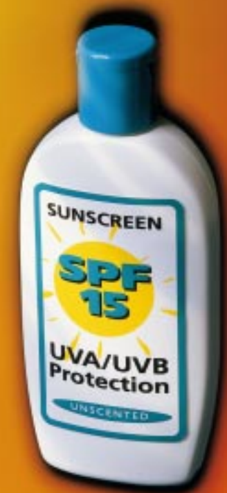
rub it on