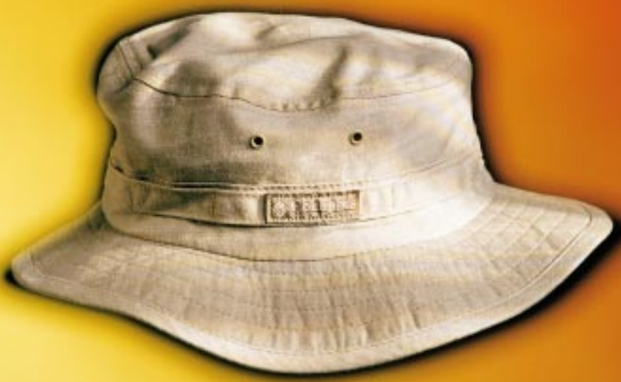
get a hat

Protect yourself from the sun's UV rays.