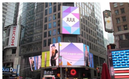
JUUL billboard in Times Square, New York City, 2015.

When JUUL first launched in 2015, the company used colorful, eye-catching designs and youth-oriented imagery and themes, such as young people dancing and using JUUL. JUUL’s original marketing campaign included billboards in New York City’s Times Square, YouTube videos, advertising in Vice Magazine , launch parties and a sampling tour. According to the New York Times , “Cult Collective, the marketing company that created the 2015 campaign, “Vaporized,” claimed that the work “created ridiculous enthusiasm” for the campaign hashtag, part of a larger advertising effort that included music event sponsorships and retail marketing.” 29