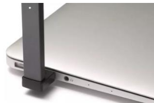
JUUL device charging in the USB port of a laptop. Image from JUUL website, accessed 1/24/18.

JUUL Labs produces the JUUL device and JUULpods, which are inserted into the JUUL device. In appearance, the JUUL device looks quite similar to a USB flash drive, and can in fact be charged in the USB port of a computer. According to JUUL Labs, all JUULpods contain flavorings and 0.7mL e-liquid with 5% or 3% nicotine by weight; JUUL Labs claims that the 5% pods contain the equivalent amount of nicotine as a pack of cigarettes. JUULpods come in eight flavors: Mango, Fruit, Cucumber, Creme, Mint, Menthol, Virginia Tobacco and Classic Tobacco. 1 Other companies manufacture “JUUL-compatible” pods in additional flavors; for example, the website Eonsmoke sells JUUL-compatible pods in Blueberry, Silky Strawberry, Mango, Cool Mint, Watermelon, Tobacco, and Caffé Latte flavors. 2 There are also companies that produce JUUL “wraps” or “skins,” decals that wrap around the JUUL device and allow JUUL users to customize their device with unique colors and patterns (and may be an appealing way for younger users to disguise their device).