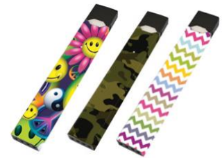
JUUL skins. Images from https://www.mightyskins.com/juul/

JUUL Labs produces the JUUL device and JUULpods, which are inserted into the JUUL device. In appearance, the JUUL device looks quite similar to a USB flash drive, and can in fact be charged in the USB port of a computer. According to JUUL Labs, all JUULpods contain flavorings and 0.7mL e-liquid with 5% or 3% nicotine by weight; JUUL Labs claims that the 5% pods contain the equivalent amount of nicotine as a pack of cigarettes. JUULpods come in eight flavors: Mango, Fruit, Cucumber, Creme, Mint, Menthol, Virginia Tobacco and Classic Tobacco. 1 Other companies manufacture “JUUL-compatible” pods in additional flavors; for example, the website Eonsmoke sells JUUL-compatible pods in Blueberry, Silky Strawberry, Mango, Cool Mint, Watermelon, Tobacco, and Caffé Latte flavors. 2 There are also companies that produce JUUL “wraps” or “skins,” decals that wrap around the JUUL device and allow JUUL users to customize their device with unique colors and patterns (and may be an appealing way for younger users to disguise their device).