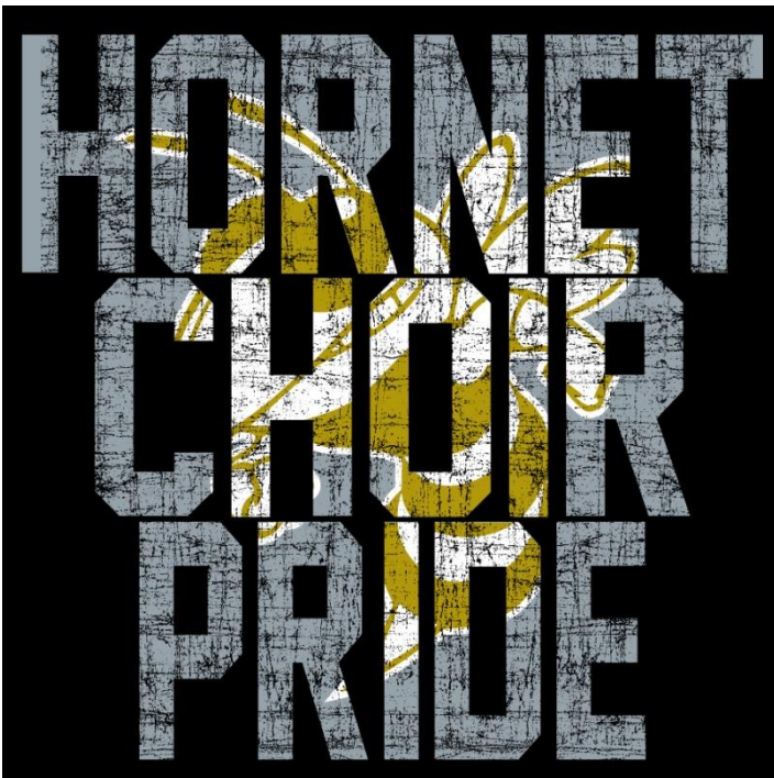
Front: silver, gold and white ink

(Black Gildan SOFT STYLE is described as fitting like a regular tee, but is ½" slimmer in the tummy, and the sleeves are less baggy. 100% cotton, preshrunk, and ringspun for softness)