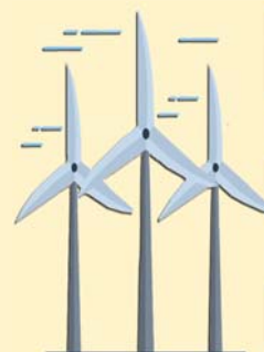
With Wind farm Reduction