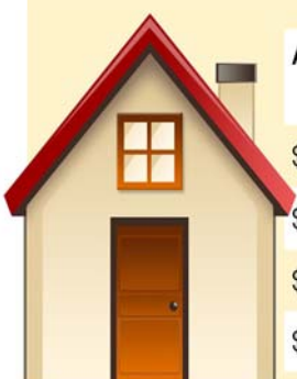
Without Wind farm Reduction

Projections indicate that a bond referendum in the amount of $30 million, repaid over 20 years, would require an Interest & Sinking (I&S) tax rate increase of up to $0.224 per $100 valuation by the year 2020. Passage of bonds only affects the I&S tax rate and not the Maintenance and Operations (M&O) tax rate used for the operating budget.