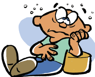
WEAKNESS OR FATIGUE