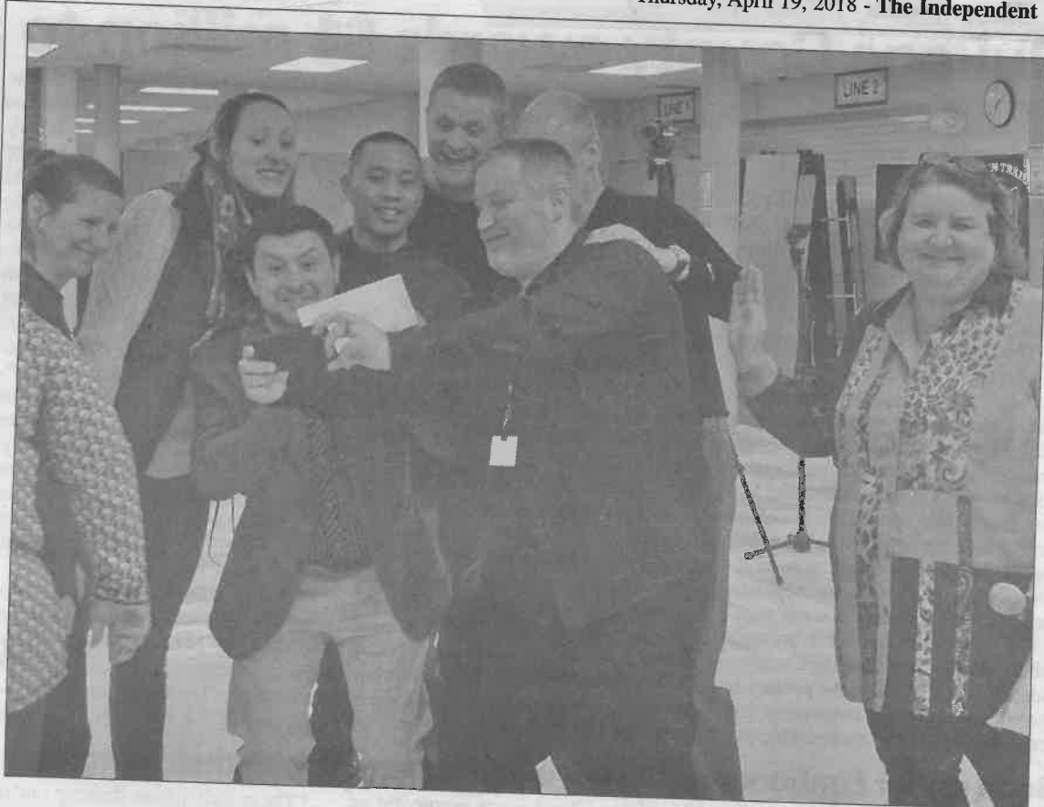
SUBMITTED PHOTO Addison Independent