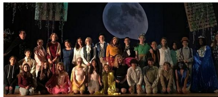
The cast of the Spring play poses on stage.