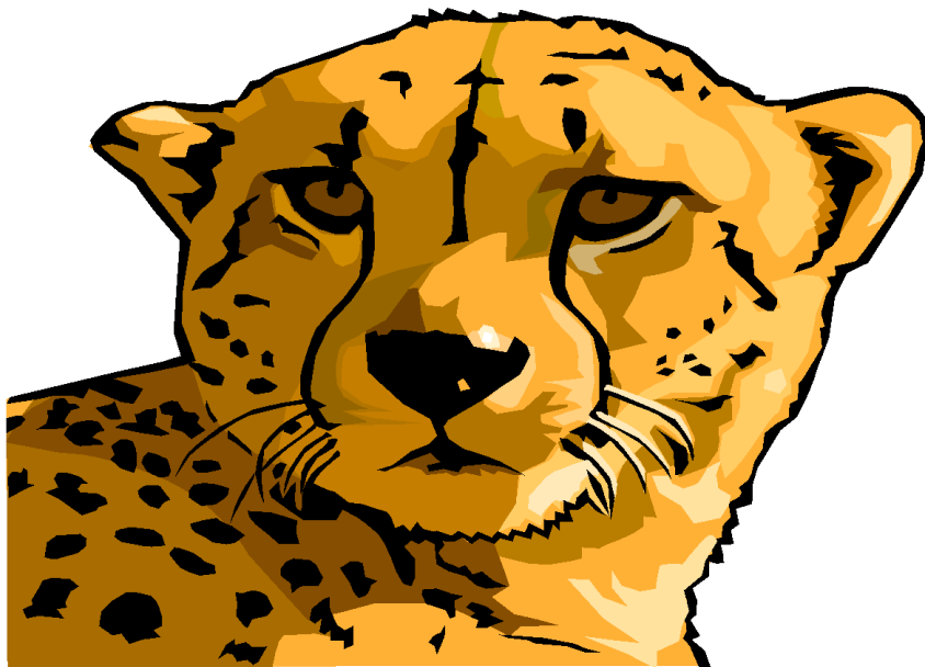
Vista La Mesa Cheetahs

3900 Violet Street La Mesa, CA 91941 (619) 825-5645 Fax: (619) 825-5783