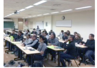
Evening Student Council Session

Thank you to all student council representatives for taking an active leadership role in carrying out school activities and service projects.