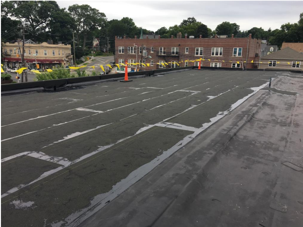
June 2018: Belleville ES #3 –end of first day of roof replacement activities.