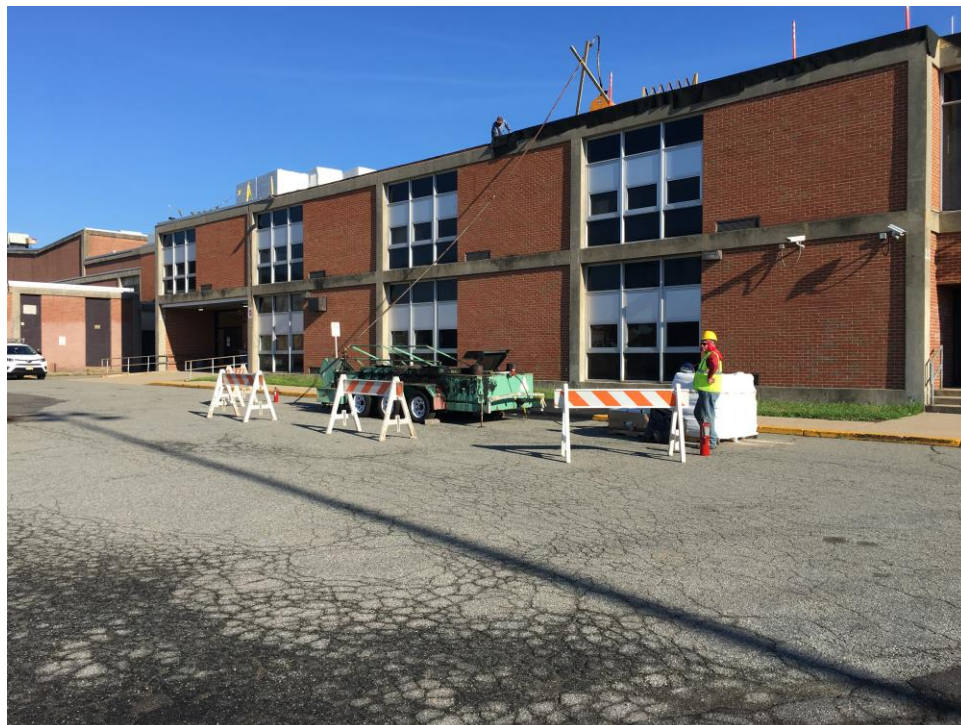
June 2018: Belleville HS – kettle setup at the High School.