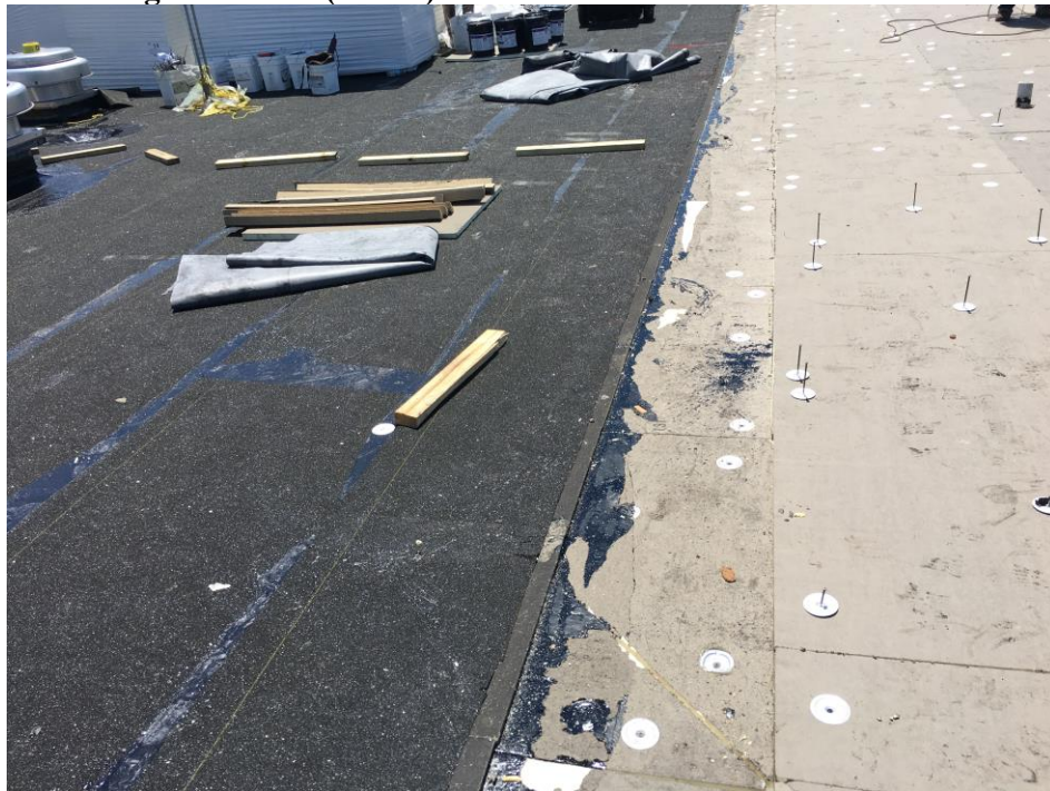
June 2018: Belleville HS –ongoing roof replacement day two.