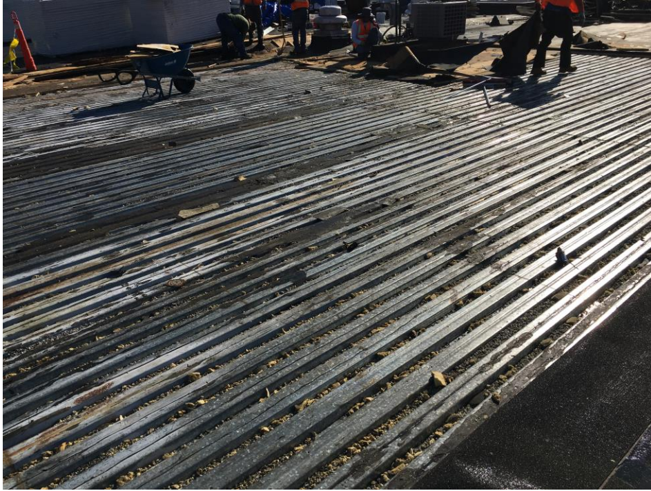
June 2018: Belleville HS – ongoing existing roof removals.