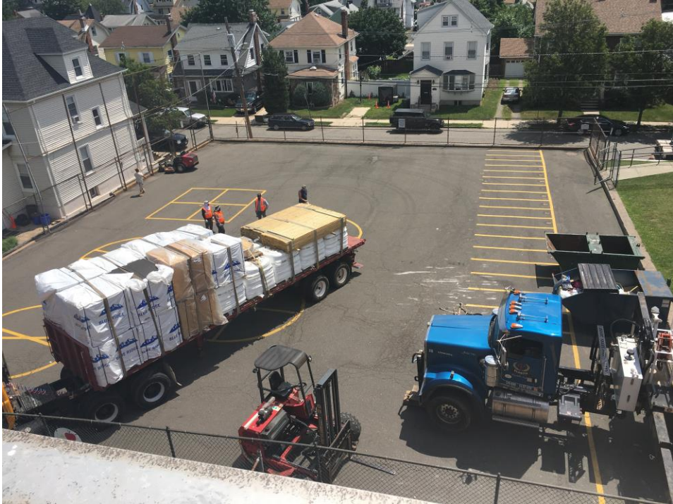
June 2018: Belleville ES #3– Roofing materials being received on site.