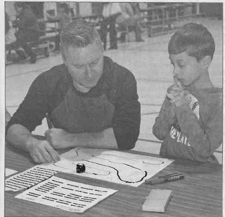
A Fullerton student and his father watching the Ozobot follow the path that the student had designed using color codes to control the tiny robot's movement. It was all part of Family Tech Night held at Fullerton School on Jan. 24.