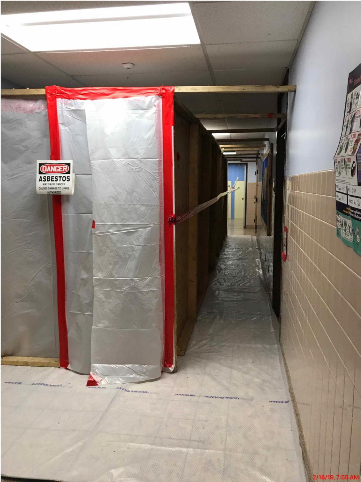
Elementary Locker Rooms Prepped for Abatement During Presidents Week Recess