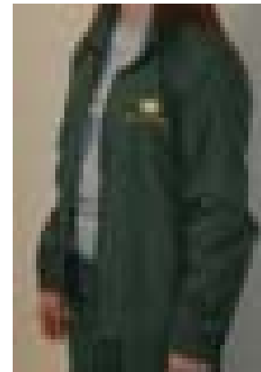
LIGHT WEIGHT WIND JACKET 100 % POLYESTER SHELL. JERSEY LINING SIDE POCKETS AS- AXL GREEN $25