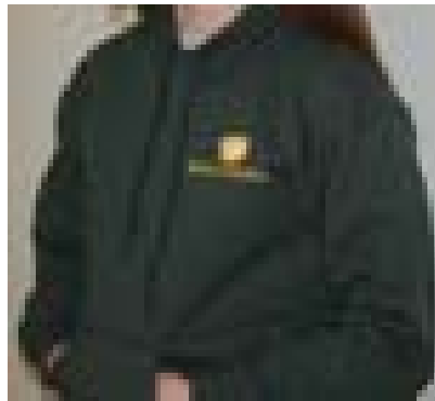
SWEAT SHIRT 7.75 OZ 50/50 BLEND DOUBLE NEEDLE STITCHING . POCKET POUCH. DOUBLE LINED HOOD WITH DRAWSTRING( YOUTH HAS NO DRAWSTRING) YXS-AXL GREEN $24