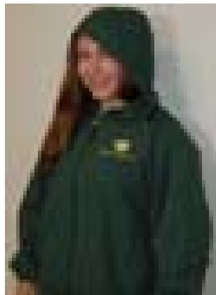
HOODED JACKET 100 %POLYESTER SHELL. JERSEY LNING MESH INSETS FOR ADDED BREATHABILITY.DRAWCORD WITH TOGGLES. SIDE POCKETS . YS-AXL GREEN $27