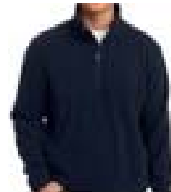
FLEECE FULLZIP 100% POLYESTER. TWILL TAPED NECK BUNGEE CORD ZIPPER PULL OPEN CUFFS, OPEN HEM WITH DRAWCORD YXS- AXL NAVY $30