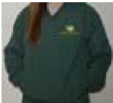
WIND BREAKER 100% POLYESTER. JERSEY LINING RIB KNIT V NECK COLLAR. RAGLAN SLEEVES. SIDE POCKETS LEFT SIDE SEAM ZIPPER YS-AXXL GREEN $23