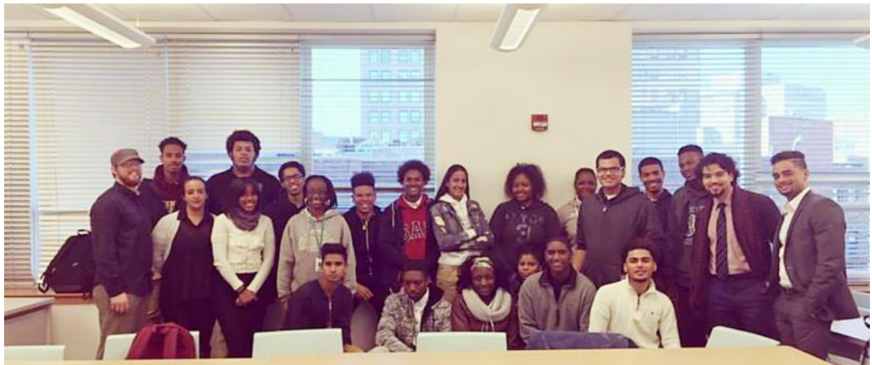
Students of Abraham Lincoln High School's CTE Program gain real-world experience through two programs.