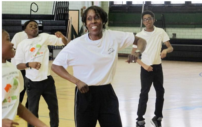
Four-time Olympian Joetta Clark Diggs visited PS 39 for a culminating activity/workout with students on the final day of her SISCO program.

Joetta Clark Diggs, New Jersey's four-time Olympian and NJ's Hall of Fame Inductee (Class of 2013), and her Foundation concluded their 10-week "Fitness/Academic Program" at PS 39 on the morning of January 15. The Joetta Clark Diggs Program is: Students Interested in Sports Career Opportunities (SISCO). This program, which also has a physical fitness and wellness component, introduces the various opportunities that exist in the sports industry to elementary, middle, and high school students.