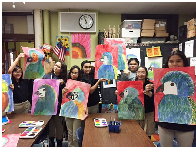
Students reveal their portraits of "Zachary the Parrot." We think Zachary approved of all portraits.