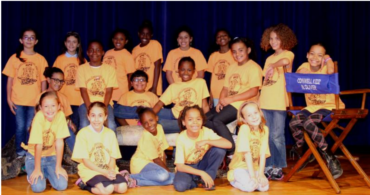
Ladies and gentlemen, The Conwell Kidz!