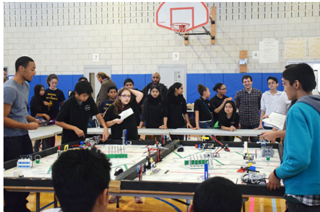
Students competed in the First LEGO League competition at Frank R. Conwell MS 4 in December.

Sixteen district schools participated in the event held at Frank R. Conwell MS 4 in Downtown Jersey City.