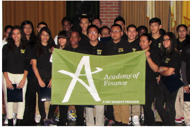
Ferris Finance students proudly show off their banner.

Forty-six freshmen from the James J. Ferris High School Finance and Hospitality & Tourism SLCs participated in a program where they were accepted into the National Academy Foundation (NAF). NAF students complement their core academic studies with a focus on a career theme. The structure and rigor of an academy education inspires self-discipline and prepares students to handle the demands of higher education and employment. Students refine their competitive edge through job shadowing, student conferences, and public speaking opportunities. Ferris High School's objective is to provide rigorous academic and challenging technical curricula coupled with industry-certified curriculum assessments and certified work-based learning experiences to become college and career ready. Students in both SLCs are required to complete NAF-required courses as part of their 4-year education. The students will also receive a wide array of support to help them meet their individual goals and stay on track.