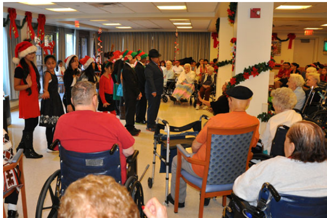
Senior citizens at the Cusack Care Center in Journal Square enjoyed some caroling by PS 23 students.

The Character Education Club of Mahatma K. Gandhi PS 23 has visited the Cusack Care Center in Journal Square for the past 8 years. Students performed short holiday plays, brought gifts for the residents, shared some delicious snacks, and had a visit with Santa. Most recently, they added the Hispanic Leadership Club and the Drama Clubs to perform on this trip. The children, who got along so well with the seniors and made them feel special around the holidays, also learned a valuable lesson during their visit.