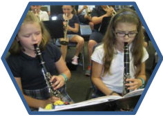
Beginning & Advanced Band

Please join the FAB today and help us to encourage learning and spiritual growth through the development of and participation in the Fine Arts programs. Your $25 sponsorship today will help us provide scholarships, musical scripts, art shows and teacher supplies, parish sponsorships, lighting, sound, and other improvements for the stage, music and art programs . . . and so much more.