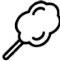
Family Fun Fair Booth