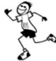
Superhero Fun Run