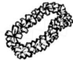
Leis for 5th Grade Aloha Assembly

Nai'a Ohana is a registered 501(c)3 nonprofit organization, our mission is: