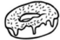
Krispy Kreme Fundraiser