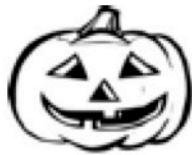
Halloween Costume Swap