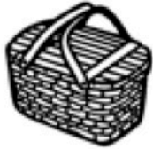
Kindergarten Family Welcome Picnic