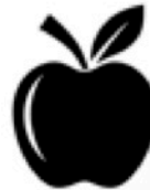
Staff Appreciation Week