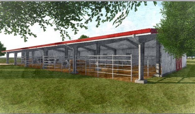
Rendering of New Ag Barn View from South