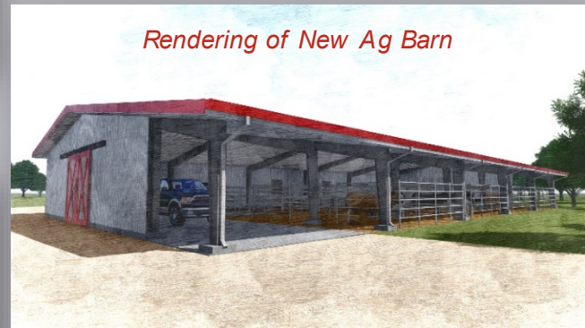
Rendering of New Ag Barn