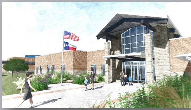
Rendering of New Primary School on Winters Mill Parkway