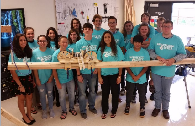
"Sofishticated Science" Robotics Team