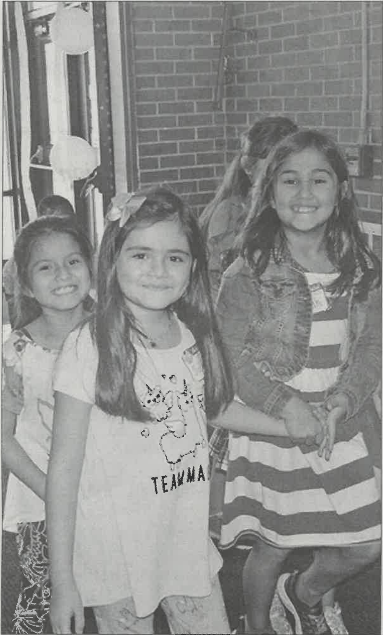
On the first day of school, Army Trail School third graders head back to the classroom after enjoying some recess time outside.

The District's students in grades 1-8 were welcomed back to their various schools with bubbles, cheering, high fives, a lot of excitement, and a little bit of rain.