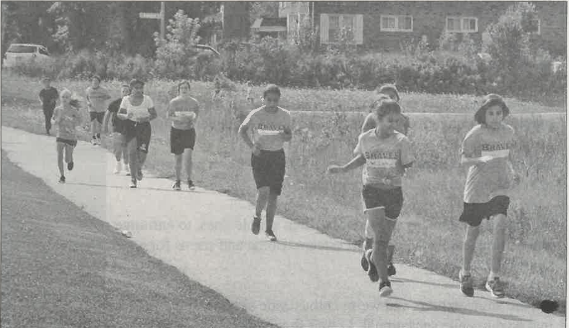
Members of the Indian Trail cross country team at their first official practice on the afternoon of the first day of school.