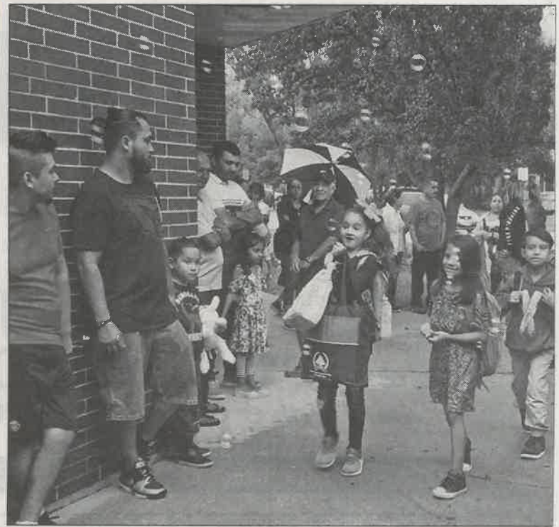
Students at Lake Park School walked through a cloud of bubbles on their way into school on their first day back.