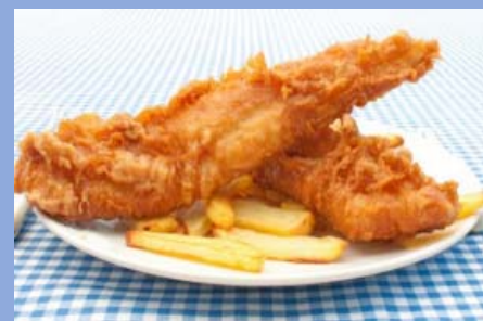
Fresh Fried Cod & Chips Dinner