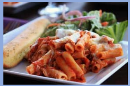
Baked Penne with Ricotta Garlic Bread & Salad

Order Now & Save $15 Adults $10 Children