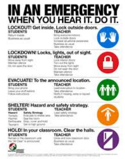
(click image to enlarge)

Meridian has incorporated the Standard Response Protocol (SRP) into its emergency procedures. Students and staff will follow the SRP during all drills and emergencies: