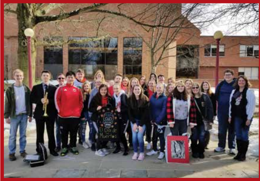
Grant support helps fund extracurricular activities, such as the Foreign Language Club visit to IUP and other club initiatives.

D uring the 2017-18 school year, SCSD earned $1,100,541 in competitive grant funding from a variety of public and private sources. This amount reflects a 14% increase in grant awards compared to 2016-17. The funds support an array of educational and safety programs designed to strengthen student performance, achievement, and campus safety. Samples of these grant awards include: