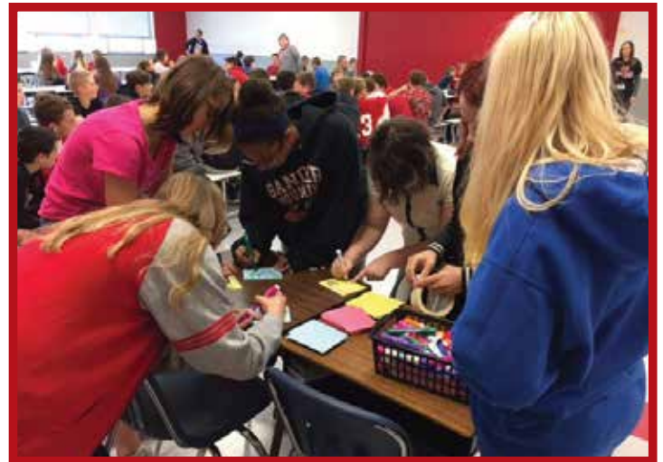
Group projects at SCMS encourage students to share ideas and work together to solve problems.

Support staff, including counselors, special education teachers, therapists, Life Skills coaches, and others are also available to students.