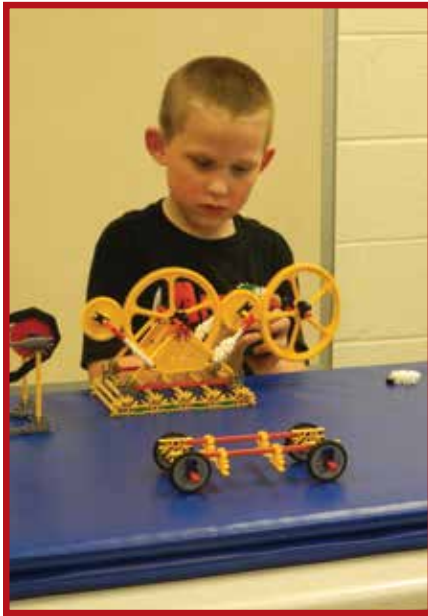
STEM activities continue to be integrated into SCE and MES classwork.

O ur elementary program includes a primary school specially designed to meet the needs of our youngest students (SCE, K-2) and an intermediate program (MES, 3-5) designed to help students strengthen academic