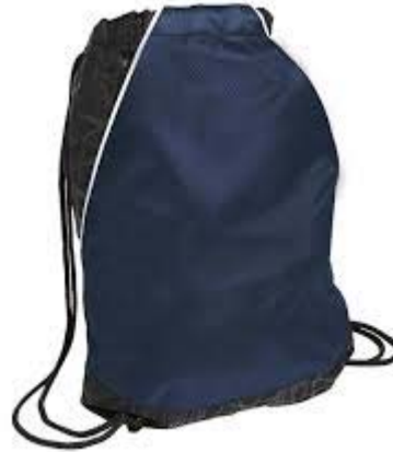
Bag Design (royal blue & black)