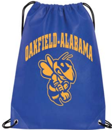
Lettering and Logo Design (gold)