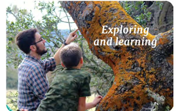
Exploring and learning