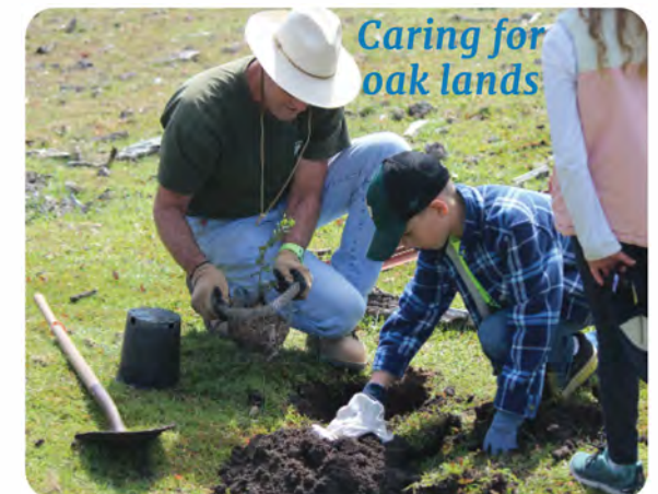
Caring for oak lands