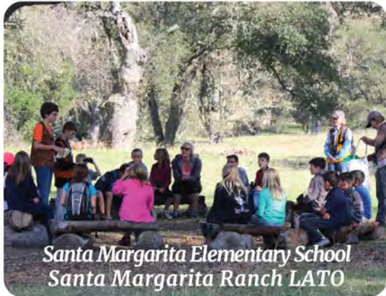
Santa Margarita Elementary School Santa Margarita Ranch LATO