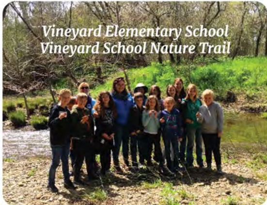
Vineyard Elementary School Vineyard School Nature Trail