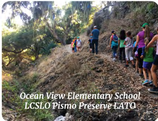
Ocean View Elementary School LCSLO Pismo Preserve LATO

Each public school partner has its own associated nature trail for guided hikes, field studies, wildlife cameras and stewardship projects. We connect kids and land.