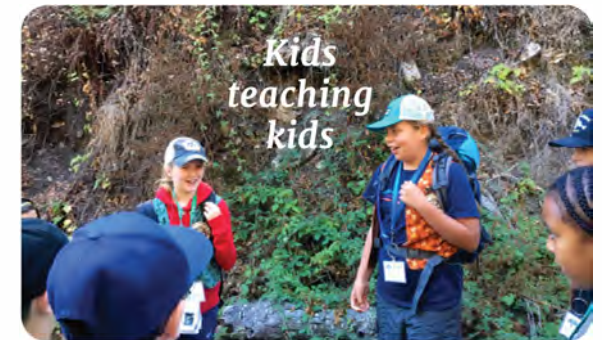
Kids teaching kids