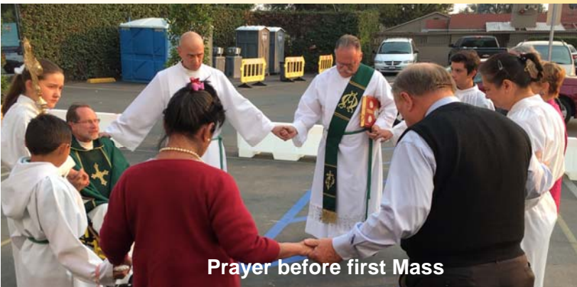
Prayer before first Mass