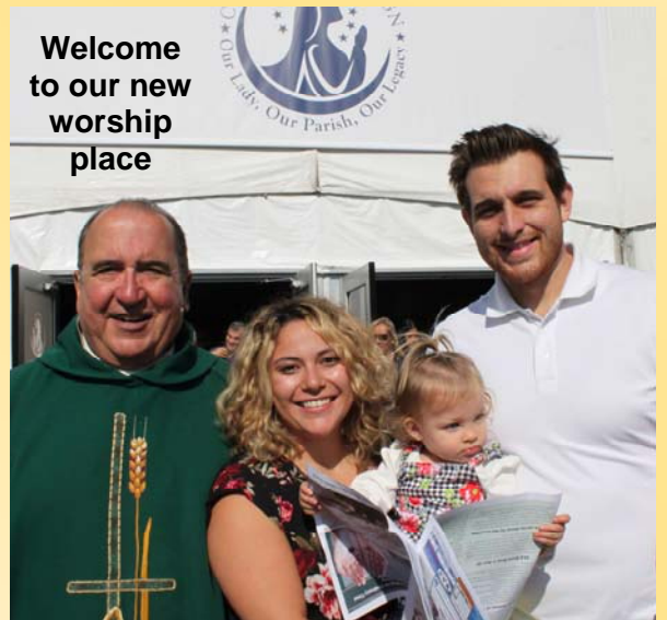
Welcome to our new worship place