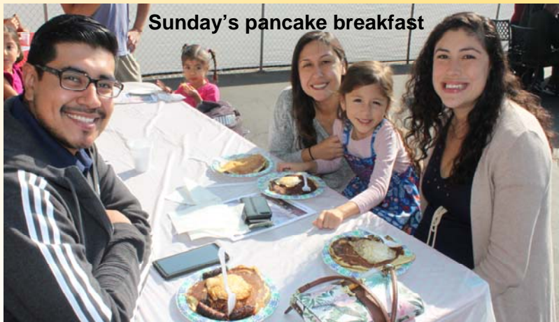
Sunday's pancake breakfast