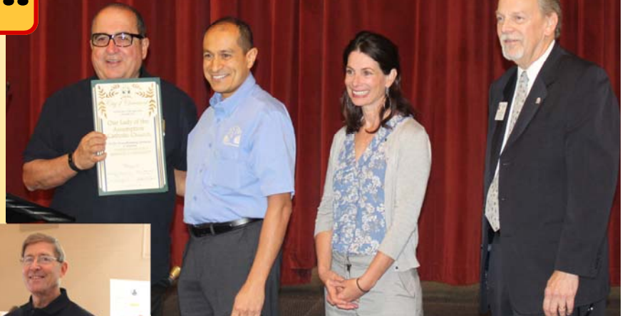
City Council commendation