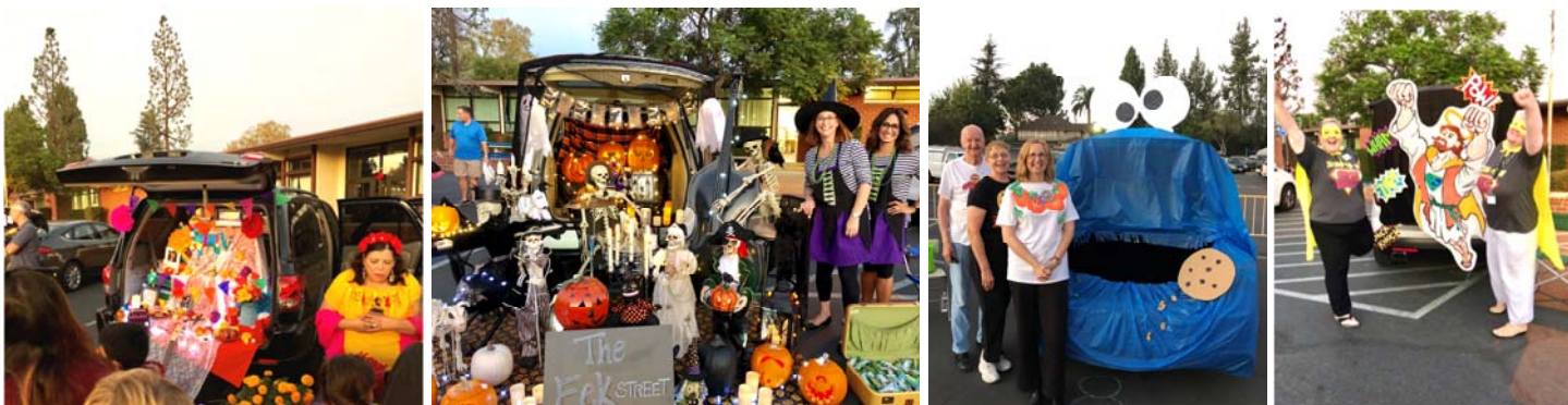
Our first Trunk or Treat event attracted a big turn-out of families with young children who enjoyed treats from imaginative car trunks, bounce houses, refreshments and music. Thanks to everyone who participated!