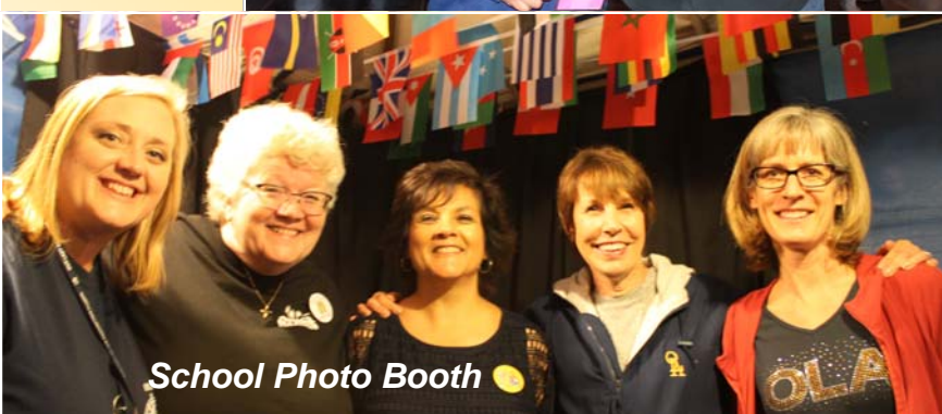
School Photo Booth