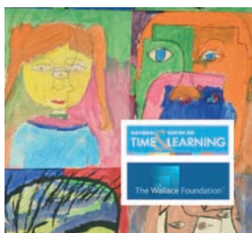
Artwork on the cover of the National Center on Time & Learning publication

The Harvard Graduate School of Education featured BART faculty in a study about effectively analyzing student data and featured BART in an educational video. Data Wise, a program of the Graduate School, focuses on an eight-step process for using data to improve learning and teaching. This particular study centered on what Harvard calls the "ACE Habits of Mind," (ACE being an acronym for a shared commitment to Action, Assessment and