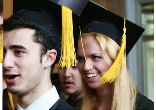
BART graduates at their commencement ceremony on June 8th, 2013