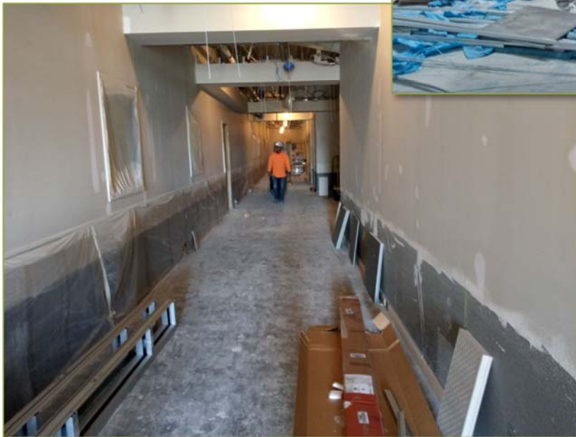
Finishes started at Men's Restroom, Open office area in, and Hallway at main entry at Area B.