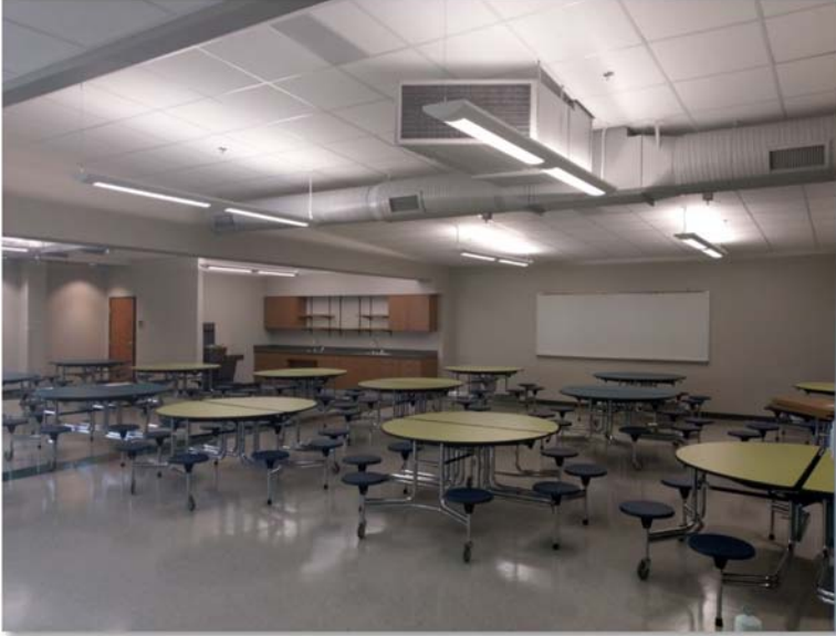
Area A Cafeteria and Main Corridor.