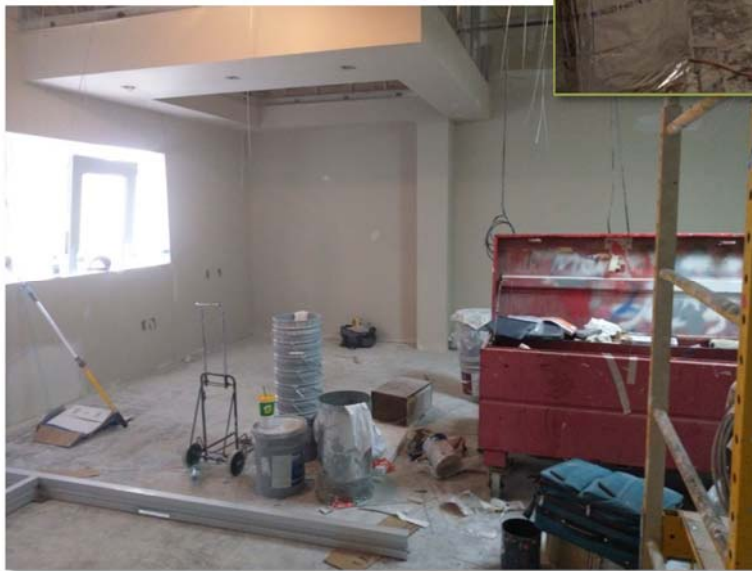
Tape, bed and paint ongoing at Corridors, Main Conference Room and Reception Area at Area B