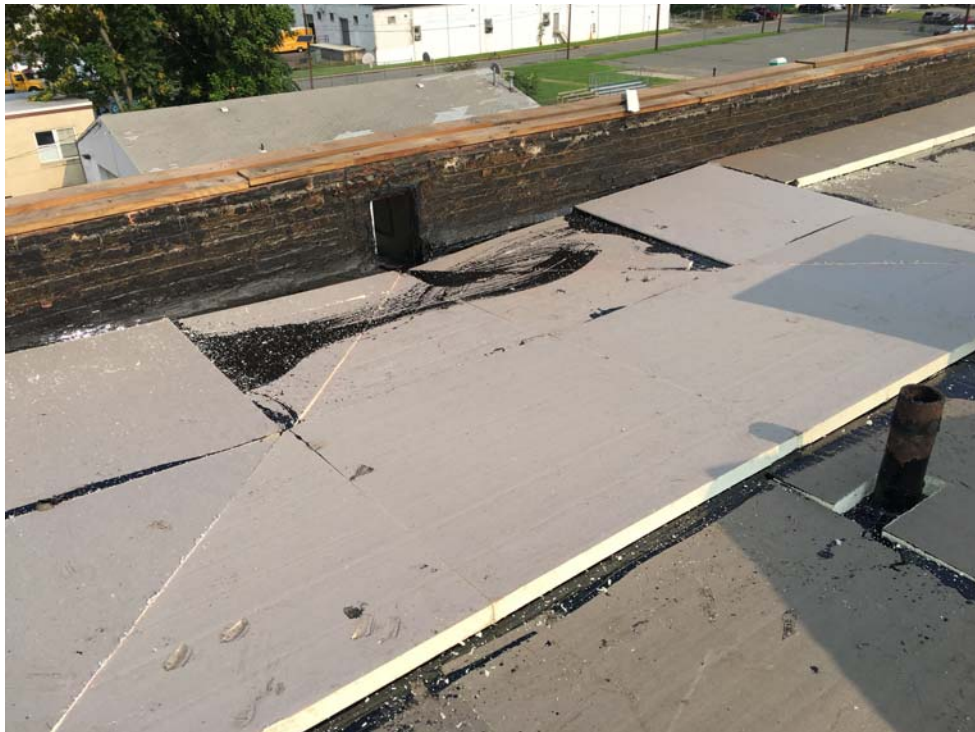
August 2018: Belleville ES #9 – Insulation being installed at scupper outlet at Roof B