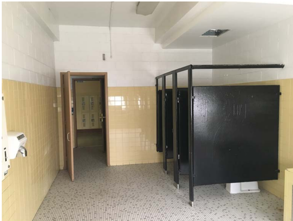
August 2018: Belleville HS – Ceilings restored in 1 st floor Student Toilet #108.