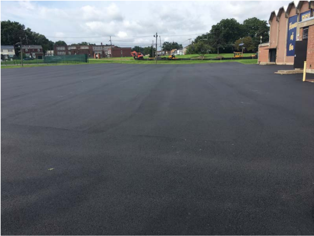
August 2018: Belleville HS – Completed paving at south side of high school.