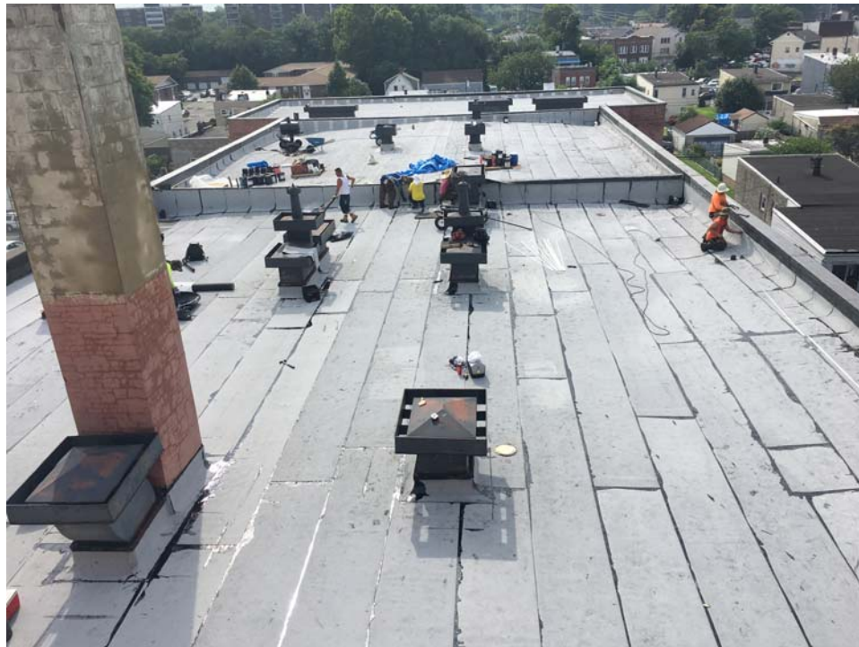
August 2018: Belleville ES #4 – Cap sheet installation completed on all roofs.