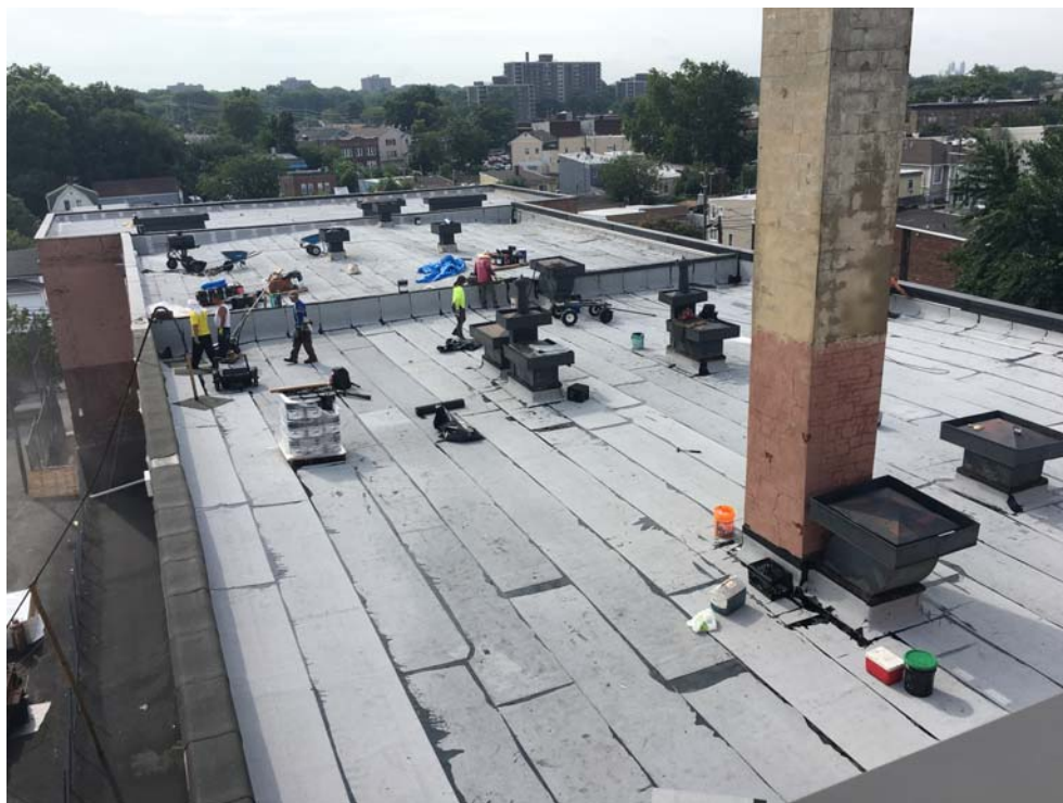
August 2018: Belleville ES #4 – EPDM membrane being installed at roof parapets.