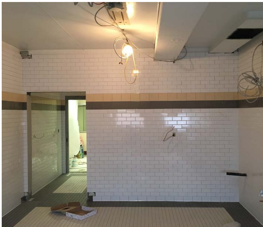
August 2018: Belleville HS – Ceramic wall and floor tile installed in 2nd floor Girl's Student Toilet.