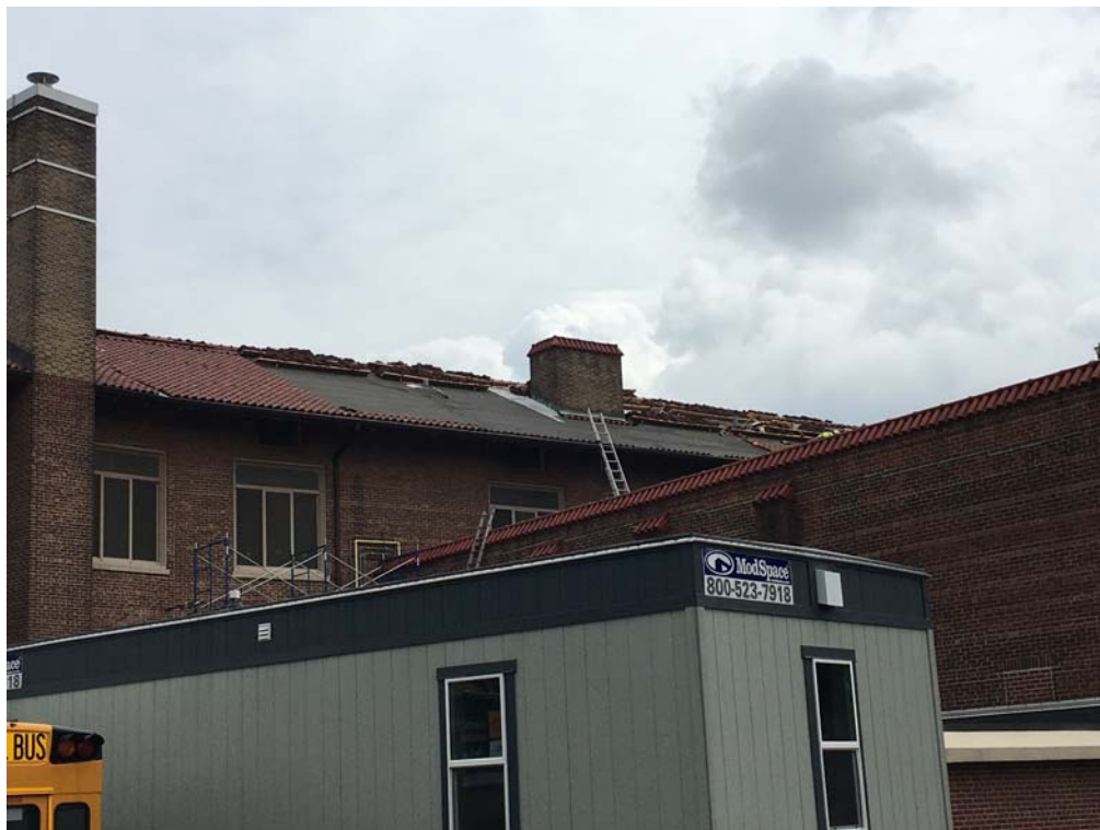
August 2018: Belleville ES #10 – Underlayment installed prior to tile replacement work.