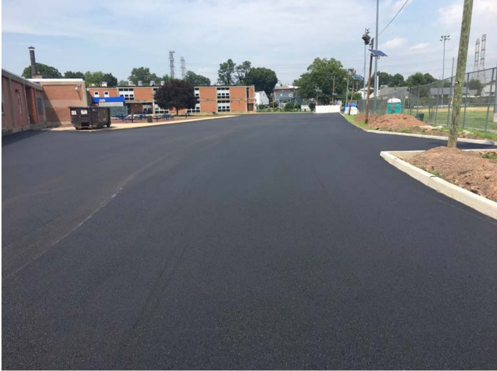
August 2018: Belleville HS – Completed curbs and paving at rear of high school.