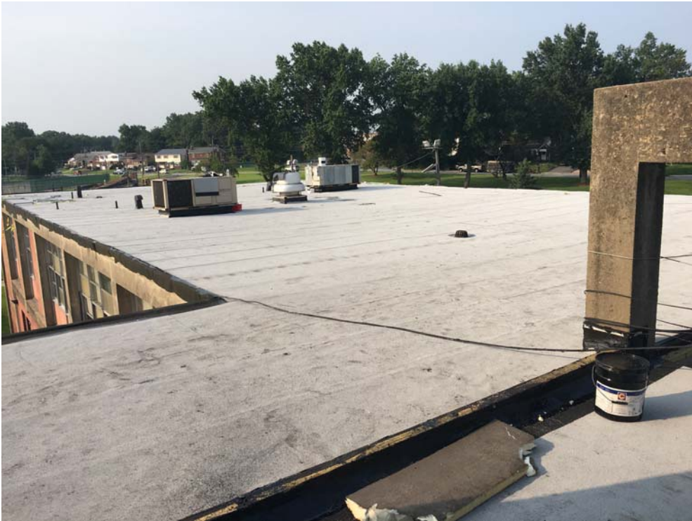
August 2018: Belleville HS – Cap Sheet installation completed on Roof D2.