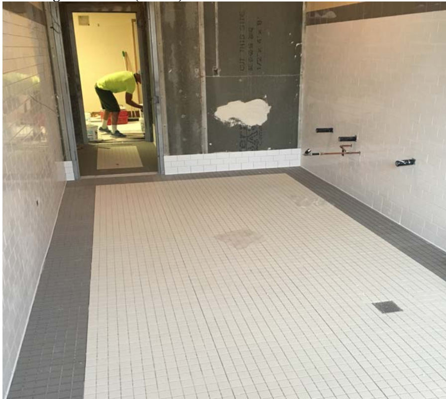
.August 2018: Belleville HS –Ceramic wall and floor tiles installed in 2nd floor Women’s Faculty Toilet.