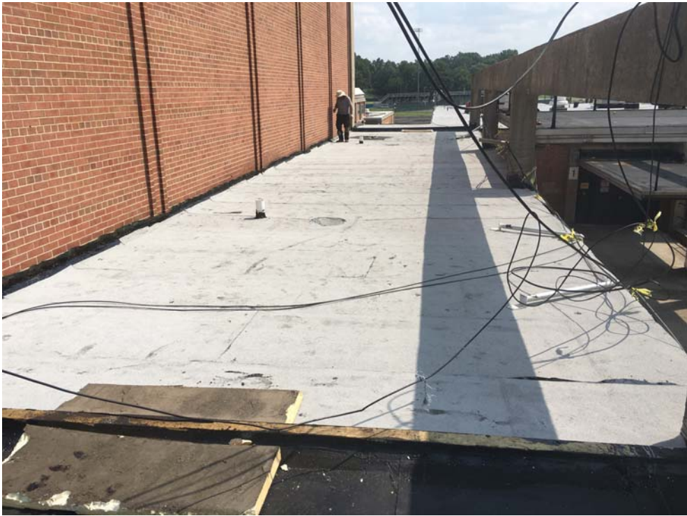
August 2018: Belleville HS – Cap Sheet installation completed on Roof D1.