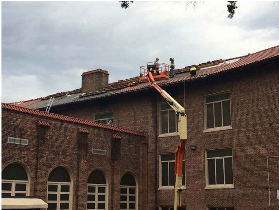
August 2018: Belleville ES #10 – Terra Cotta Roof Tile replacement underway.