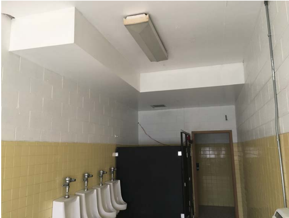
August 2018: Belleville HS –Ceilings and walls restored in 1st floor Student Toilet #106.