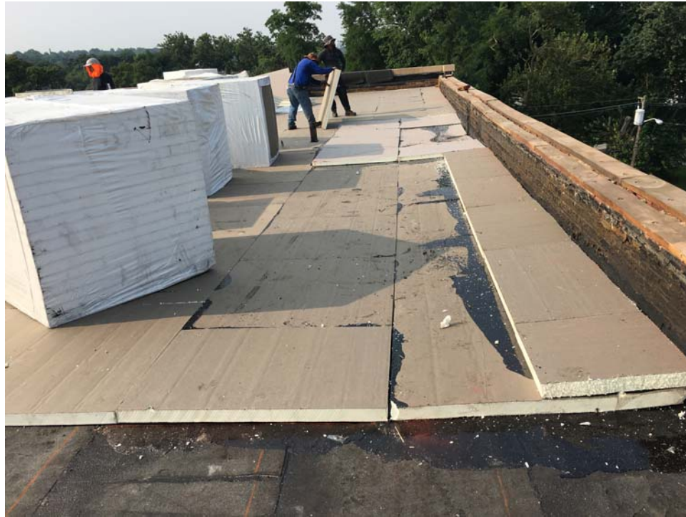
August 2018: Belleville ES #9 – Roof insulation being installed on Roof B.