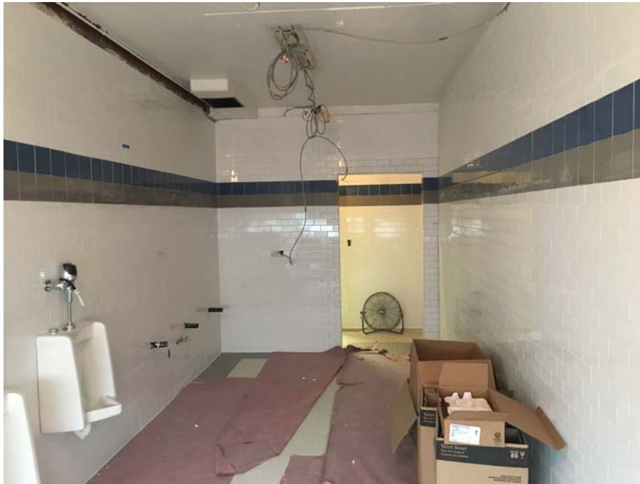
August 2018: Belleville HS – Ceramic tile & plumbing fixtures installed in 2nd floor Boy's Student Toilet.