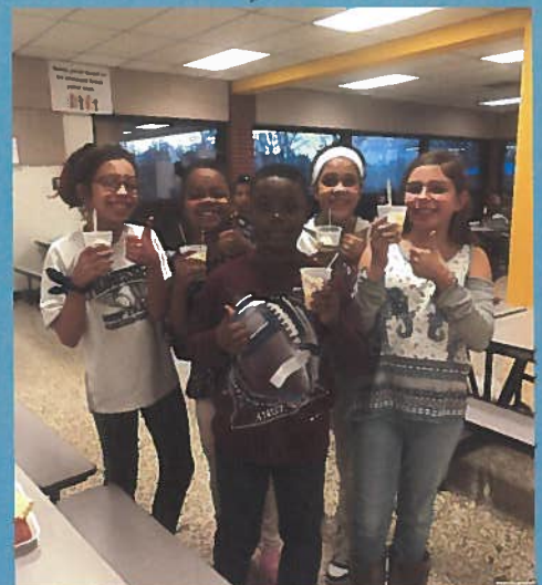
TASTY BITES on January 23rd, elementary students sampled Mini Blueberry Pie Pudding Parfait