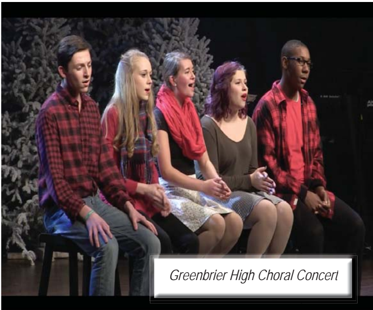
Greenbrier High Choral Concert