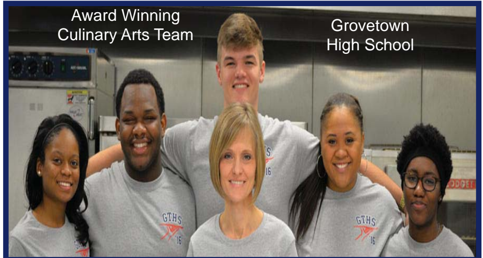
Grovetown High School