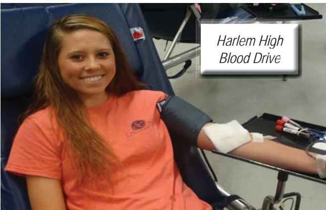
Harlem High Blood Drive