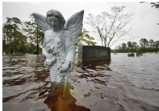
A statue of an angel is partially submerged by floodwaters Sept. 16 in the cemetery of a church where residents took shelter in Leland, N.C.

HURRICANE FLORENCE: The Carolinas were hard hit with record rainfall and flooding rivers from tropical storm Florence since it made landfall Sept. 14. The storm's slow-motion siege was blamed for at least 34 deaths, and the authorities fear additional fatalities as floodwaters fill more streets and homes. Tens of thousands of homes were damaged and about 500,000 homes and businesses were still without power Sept. 17. Monies collected this Friday through "Donation Dress Day" will be donated to Catholic Charities. As it did in response to last year's hurricanes, the agency forwards 100 percent of funds raised to the local Catholic Charities agencies that serve the affected communities. We are praying for those affected by the storm.