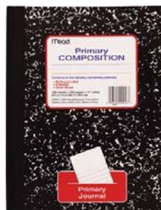
Primary Composition Book