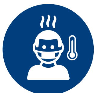
AVOID SICK PEOPLE