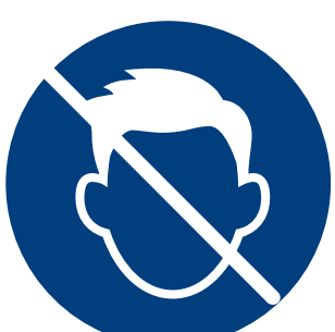
DON'T TOUCH FACE