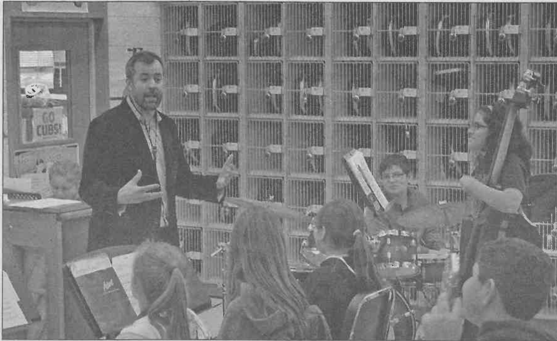
SUBMITTED PHOTOS Addison Independent