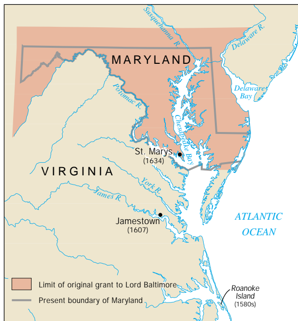
Early Maryland and Virginia

was still persecuting Roman Catholics; among numerous discriminations, a couple seeking wedlock could not be legally married by a Catholic priest.