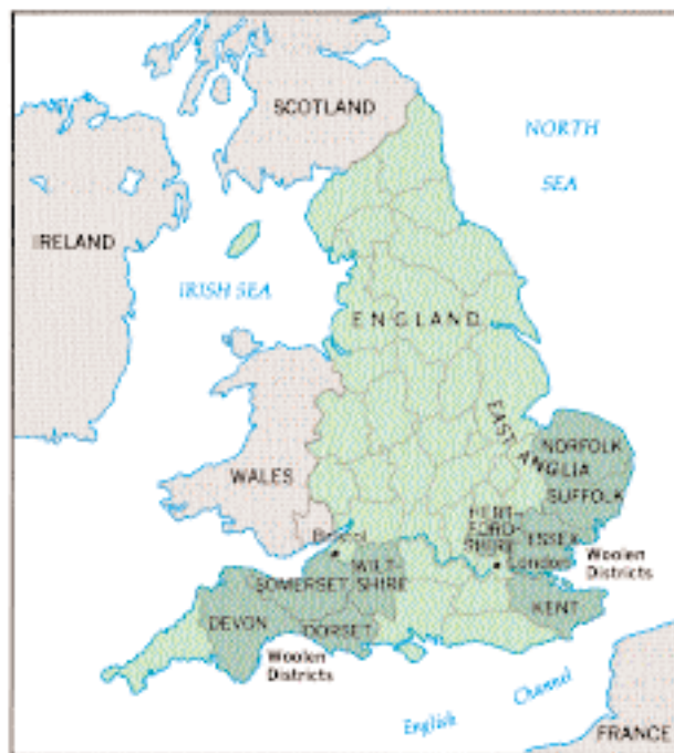
Sources of the Puritan “Great Migration” to New England, 1620–1650 The dark green areas indicate the main sources of the migration.

The charter of the Virginia Company is a significant document in American history. It guaranteed to the overseas settlers the same rights of Englishmen that they would have enjoyed if they had stayed at home. This precious boon was gradually extended to subsequent English colonies, helping to reinforce the colonists’ sense that even on the far shores of the Atlantic, they remained comfortably within the embrace of traditional English institu-